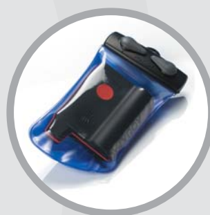
Water proof bag